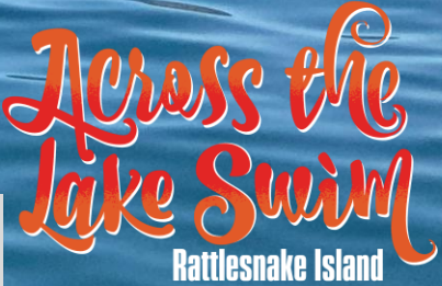
View towards Peachland and Finish from Rattlesnake Island